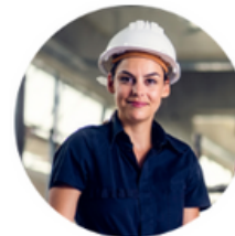
Design & Construction

Visit https://www.ashe.org/ashe-education for more information.