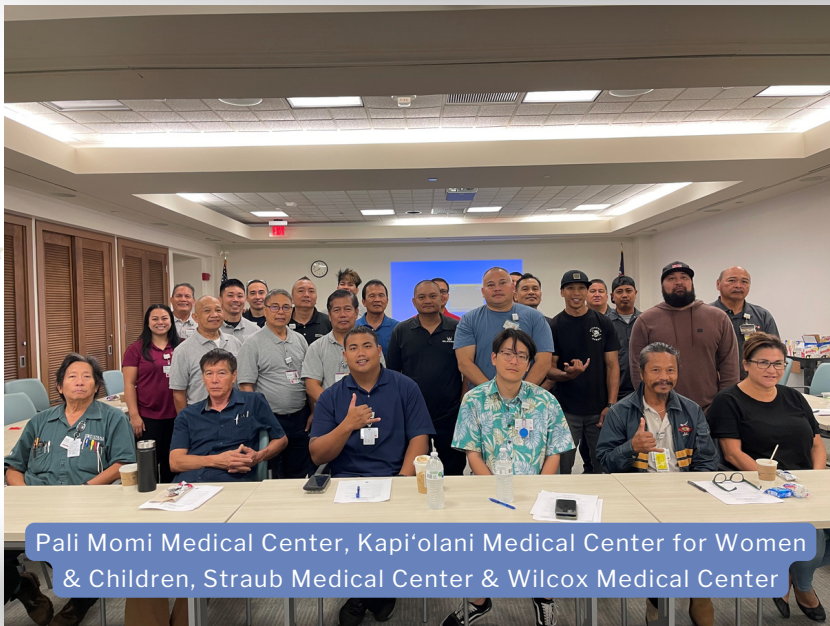
Pali Momi Medical Center, Kapi'olani Medical Center for Women & Children, Straub Medical Center & Wilcox Medical Center