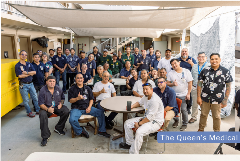
The Queen's Medical Center Manamana-Punchbowl