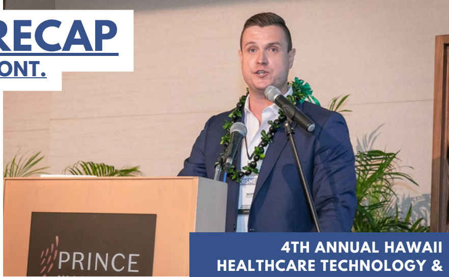
4TH ANNUAL HAWAII HEALTHCARE TECHNOLOGY & FACILITIES ENGINEERING EXPO CONT.