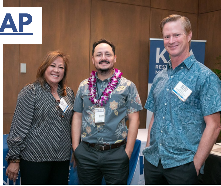
4TH ANNUAL HAWAII HEALTHCARE TECHNOLOGY & FACILITIES ENGINEERING EXPO